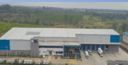
Tatu Distribution Centre, 2020