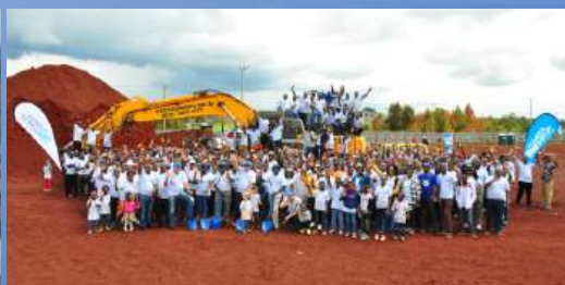
Founders Day, 2019