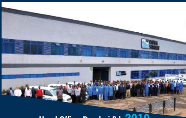
Head Office, Dundori Rd, 2010