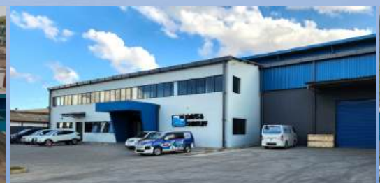
Zambia Distribution Centre, 2025