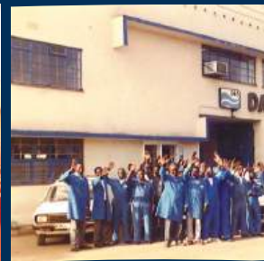
Head Office, Dundori Road