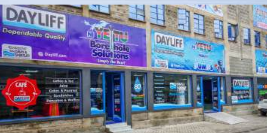
Head Office Customer Centre, 2026

The liberalisation of Kenya's economy in the early 1990s marked a turning point for the company. The introduction of Pedrollo pumps from Italy, now one of the