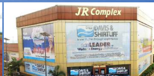
Uganda Head Office Relocates, 2018