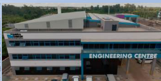
Tatu Engineering Centre, 2026