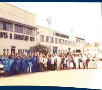
Dundori Rd, 1995