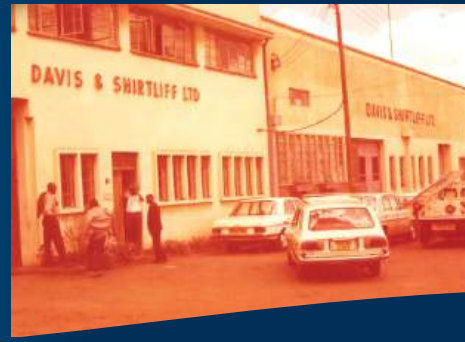
Head Office, Dundori Road, 1975